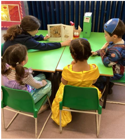
As part of our World Book Day celebrations, pupils in 6B enjoyed sharing their love of reading with the younger children in the school. they had time sharing books with pupils in Reception.