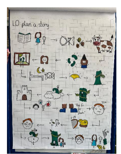
the tale with me next week.

This week, pupils in Year 1 have been learning and innovating the story of Jack and the Beanstalk. They have created alternative versions in which the giant is replaced by another villain, ranging from dragons to witches to dinosaurs. We have been particularly impressed with their vocabulary this week as many pupils have been describing feelings of characters in very creative ways.