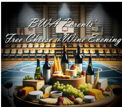
Join us to share a glass of wine and a cheese board, on the house! Mingle with fellow parents and PTA volunteers, and discover more about the school community. Tue, 7 Nov, 7pm-9pm. Main school hall, enter through school receptio

To help parents with strategies to support children learning their times tables and in understanding the Year 4, MTC we are pleased to offer a virtual 'workshop' on <u>Tuesday 14<sup>th</sup> November at 2-3pm and again at 5.30-6.30pm</u>. An email has been sent out with the Zoom details to join the events.