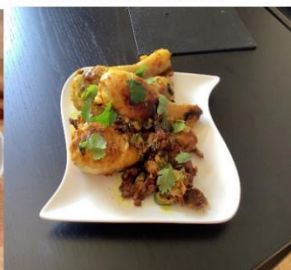
Miya Chicken Pakora