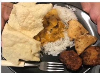
Carla Chicken Tikka Masala