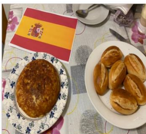
Iker Spanish Omelette