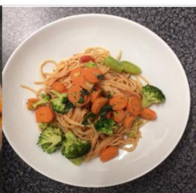
Katelyn Vegetable Spaghetti