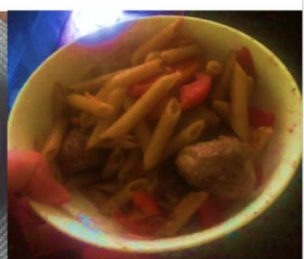
Sophie Italian-style Meatballs