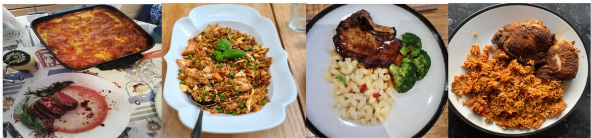
Marvyn Steak and Potato Dauphinoise