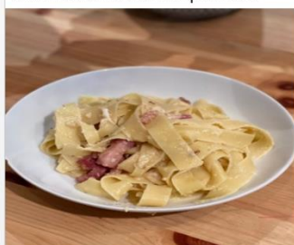
Sam Spaghetti Carbonara