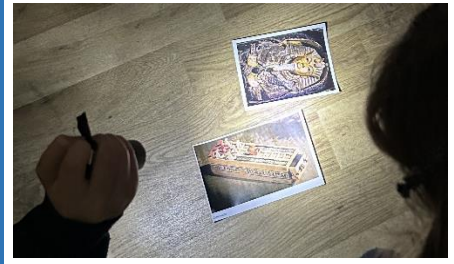
the way the world began.

Pupils in Year 3 had their classrooms transformed into an Ancient Egyptian tomb. They searched for Tutankhamun's hidden artefacts and explored what each object revealed to us about life back then.